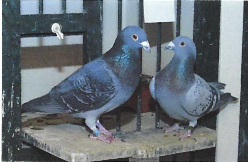
Sire and Dam of "Four Starzzz Dream". "IRON LADY" won 1st Combine 600 miles by over 5 hours and is the dam of the 2005 Sun City Million Dollar Race winner.